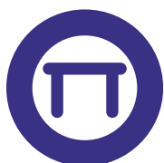
Table Top in the Product Fair - US$2,500